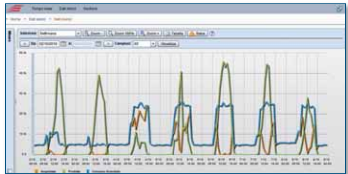
Energy captured, produced and consumed in Energy Sentinel PV.